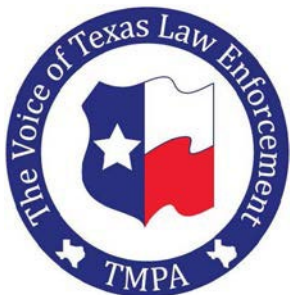
Texas Municipal Police Association