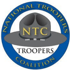
National Troopers Coalition